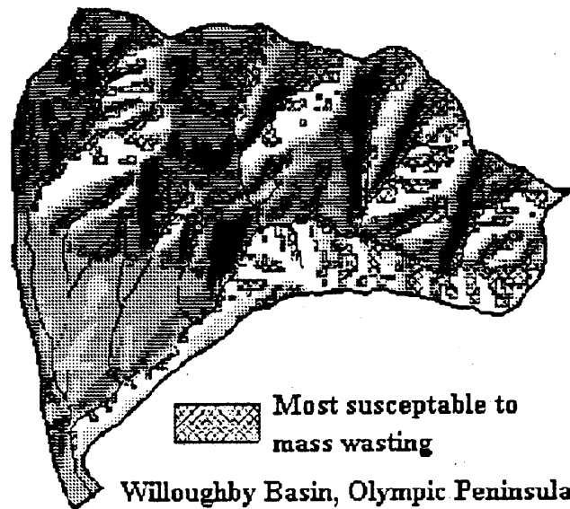
FIGURE 1. GIS-defined areas of high susceptibility to mass wasting (i.e., shallow landslides) in the 2000-acre Willoughby Creek watershed on the western Olympic Peninsula, Washington.